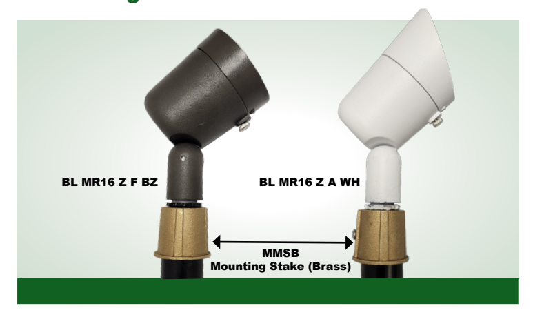
FINISH — A Super Durable Polyester powder coat finish is electrostatically applied. Standard colors available: Black, Bronze, White, or OD Green. Custom colors available upon request.